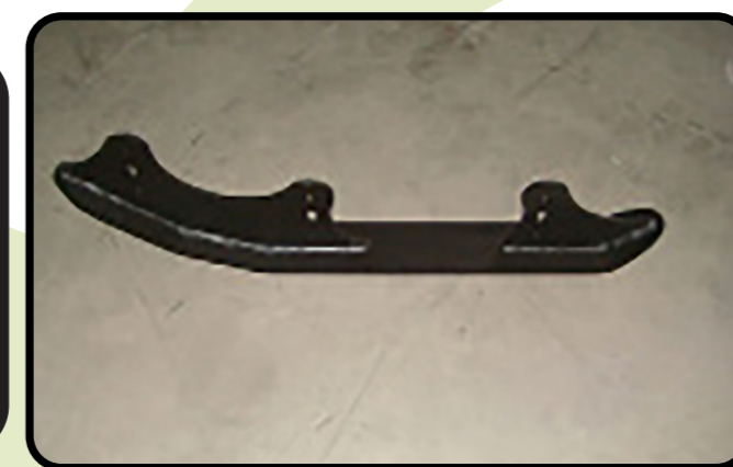
▶ Skid shoes adjustable