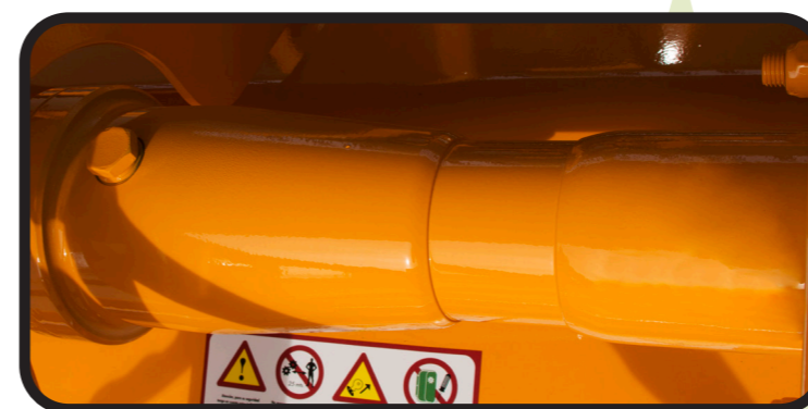
▶ Freewheel on sleeve