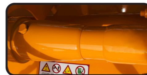
▶ Freewheel on sleeve