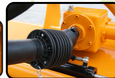
▶ Freewheel on transmission