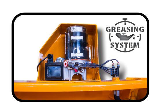
► Centralized greasing